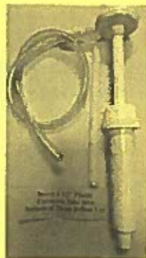
ST-XM-1 1 Gallon Pump