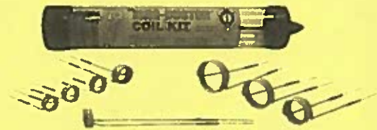
MD99-650 Mini-Ductor Coil Kit

The Mini-Ductor Coil Kit includes 8 different coils, 7 different sizes for most jobs mechanics run into. (1-3/4" ID, 1-1/2" ID, 1-1/4" ID, 1" ID, 7/8" ID, 3/4" ID and a long 3/4" ID)