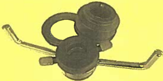
Part No. HW124-408-006 Steel Progrid Quicknut with Handles and Pressure Cup