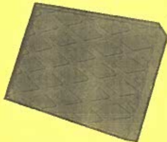
Part No's. JORB-1 and JORB-3 Rubber Blocks - (Sets of 4 Blocks)