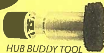
HUB BUDDY TOOL